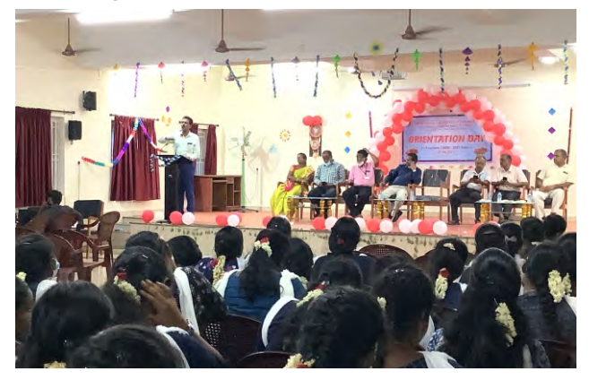
Welfare, TNAU, Coimbatore was the Chief Guest. The function ended with cultural programme performed by Freshers' batch 2020.